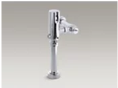
Touchless DC 1.6 gpf toilet flushometer 99440955